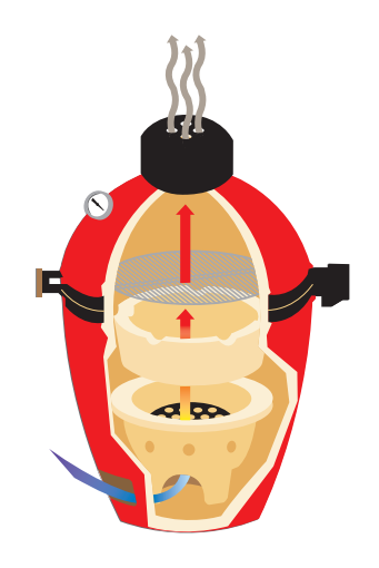
Diagram of air flow.

1.For "low and slow" temperatures like 225°F, start with a very small fire in one area of the charcoal.