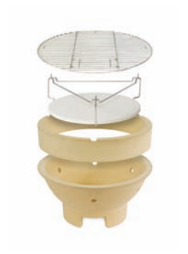
Roasting "Bottom" configuration.

1. When the 100% Natural Lump Charcoal is fully lit, secure the Heat Deflector legs in the notches of the fire ring and place the ceramic plate in the top or bottom position. The bottom position should be used if you want to place a drip pan between the Heat Deflector and cooking grate. You will not damage the ceramic plate if you allow the drippings to fall onto it. For Heat Deflector cleaning instructions, see page 16.